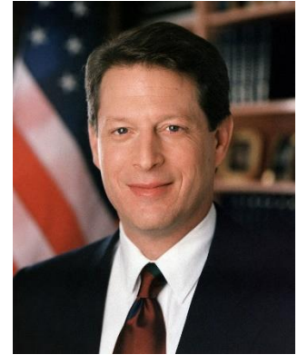
Al Gore Democrat