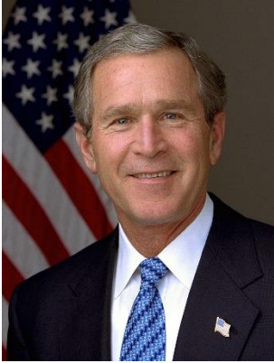
George W. Bush Republican

Bush v. Gore – Supreme Court ruled hand re-counts to cease= Bush was declared winner.